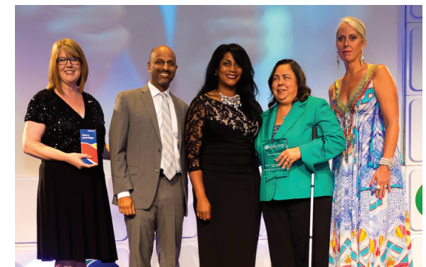
Receiving the Marketplace Innovator of the Year, Disability Inclusive Advertisement award from the United States Business Leadership Network (USBLN)