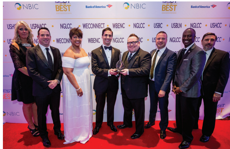
Awarded Best-of-the-Best recognition from the National Business Inclusion Consortium (NBIC)