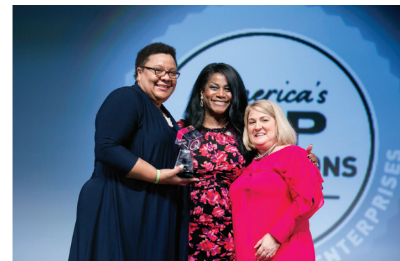
Awarded America's Top Corporation for Women's Business Enterprises – Platinum Distinction by the Women's Business Enterprise National Council (WBENC)